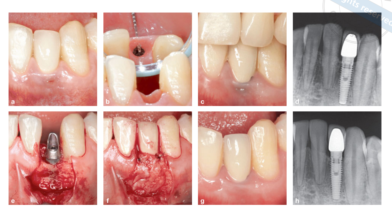
Fig 2 (a) Fistula in the buccal gingiva of an implant-supported restoration of the mandibular left lateral incisor. (b) Fistula opposite the implant-abutment interface. (c) By the 3-year follow-up, the fistula remained. (d) Radiograph taken before SCTG surgery. (e) During surgery, the buccal bone showed apical absorption at a distance 2 mm from the shoulder of the implant, and the buccal bone thickness was only 1 mm. (f) A SCTG was sutured on the implant surface. (g) During 36 months of follow-up, the fistula did not recur. (h) Radiograph taken after 36 months of follow-up.