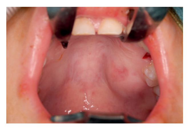
Fig 1 Tumour in the left hard palate; bigger than 2 cm and of a hard consistency.