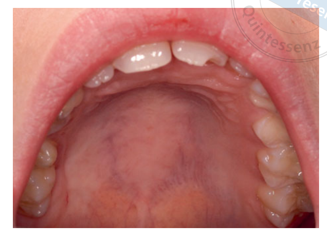
Fig 4 After a 2-year follow-up there is no evidence of recurrence.

(Received Jan 10, 2018; accepted Feb 27, 2018)