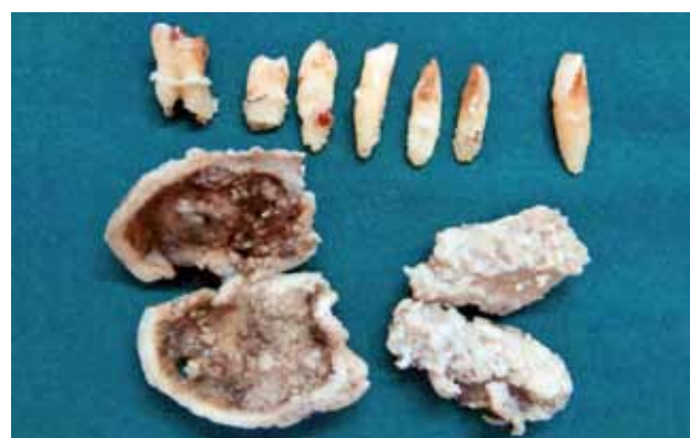
Fig 6 Gross specimens showing a solitary cystic lesion (right) and a solid lesion with an ill-defined margin (left).