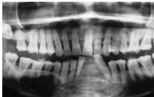
Fig 2 Panoramic radiographs showing a mixed radiolucent – radiopaque expansile lesion in the anterior segment and a well-defined radiolucent lesion in the posterior segment of mandible.