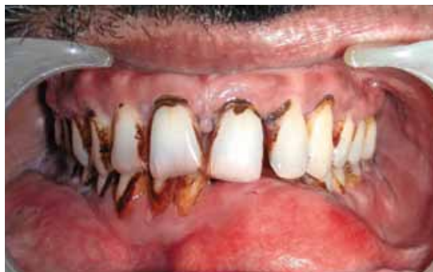
Fig 1 Intraoral view showing expansile lesion, presenting as separate swelling.