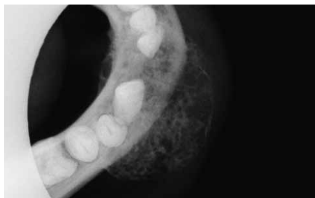
Fig 3 Occlusal radiograph of a desmoplastic ameloblastoma showing a mixed radiopaque lesion in the anterior segment of mandible.