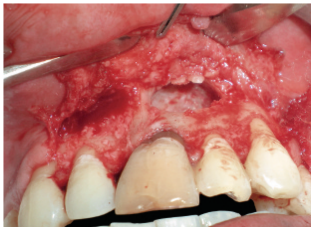
Fig 1 Defect following debridement.