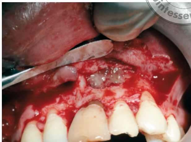
Fig 2 Placement of the PRF clot into the defect.

The procedure was explained to the patient in his own language and informed consent was obtained. The initial step of the treatment plan was to complete root canal therapy. The surgical protocol included a routine medical history followed by blood investigations. The procedure included the reflection of a full thickness mucoperiosteal flap by sulcular incision and two vertical relieving incisions. Debridement of the tissues at the defect site was followed by irrigation with sterile saline solution (Fig 1). Root resection and cold compaction was done at the apical end of the filling. The PRF clot was carefully placed till the entire cavity was filled (Fig 2). Wound closure was obtained with a 3-0 black silk suture and covered with a periodontal dressing. Analgesics, antibiotics and a 0.2% chlorhexidine mouthwash was prescribed for five days post surgery. The sutures were removed after 7 days. The patient was reviewed at regular intervals of 1 week, and 1, 3, 6 and 9 months. During the review, occlusal radiographs were taken. These follow-up visits included routine intraoral examinations and professional plaque control, if required. The case was evaluated clinically – for oedema, postoperative pain, signs of infection, untoward reaction, wound dehiscence – as well as radiographically.